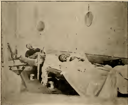
WOUNDED KANSANS IN THE HOSPITAL.